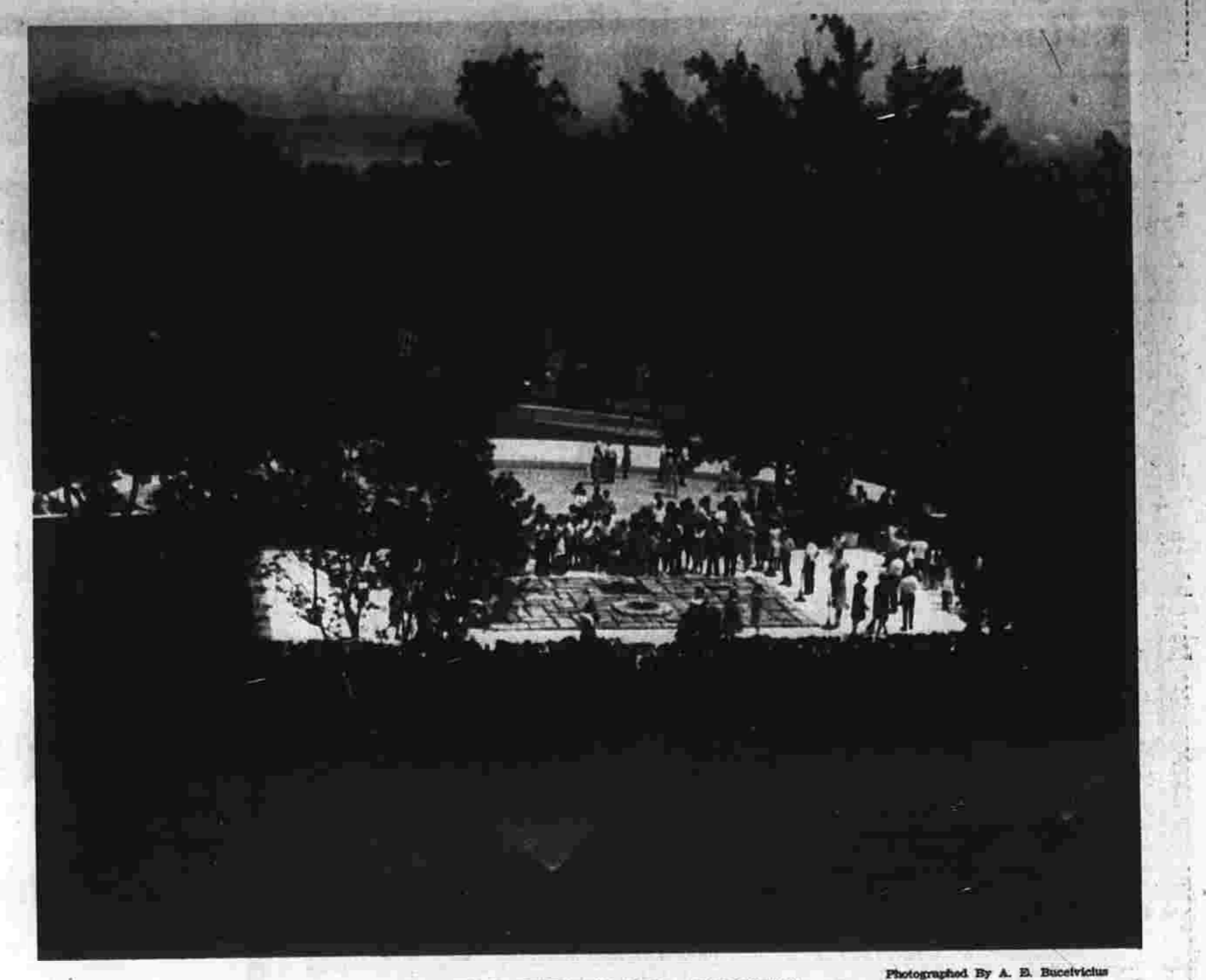
THE JOHN F. KENNEDY PLOT, ARLINGTON

Secretary Rusk, naturally enough from his and our position, is concerned with raising some kind of answer and counter-balance to the alarm and warning contained in Foreign Minister Gromyko's proclamation of what may come to be called the "Socialist Commonwealth Doctrine."